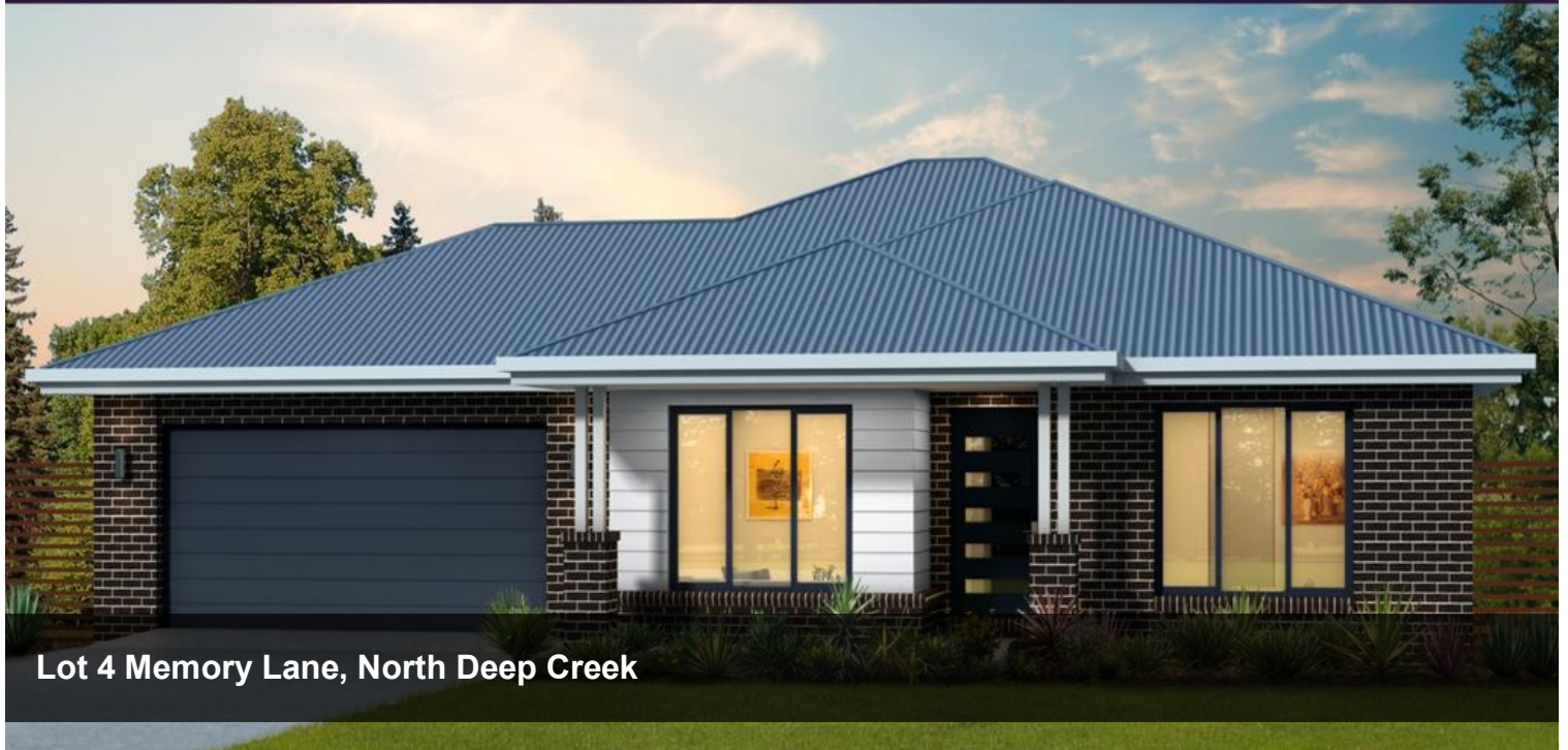
Lot 4 Memory Lane, North Deep Creek