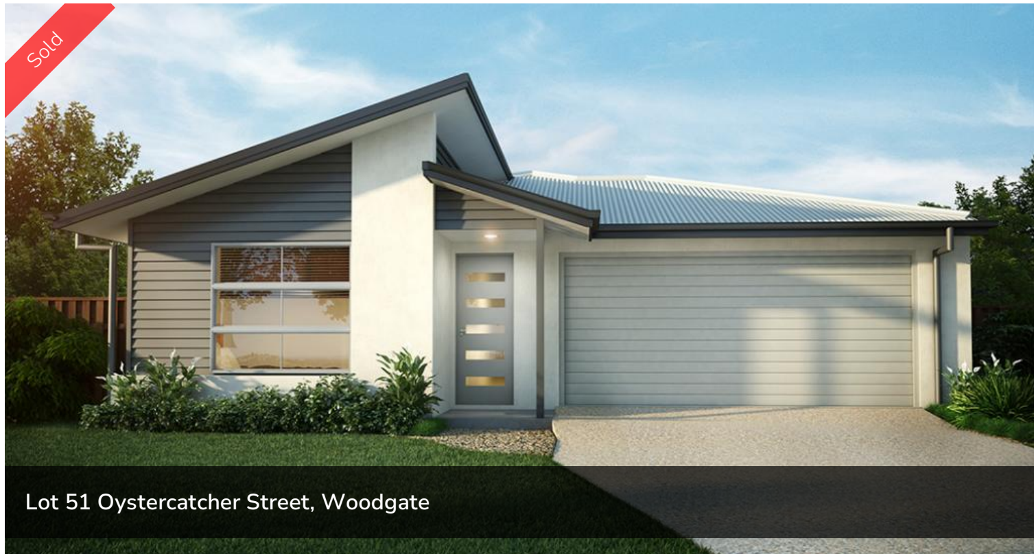
Lot 51 Oystercatcher Street, Woodgate