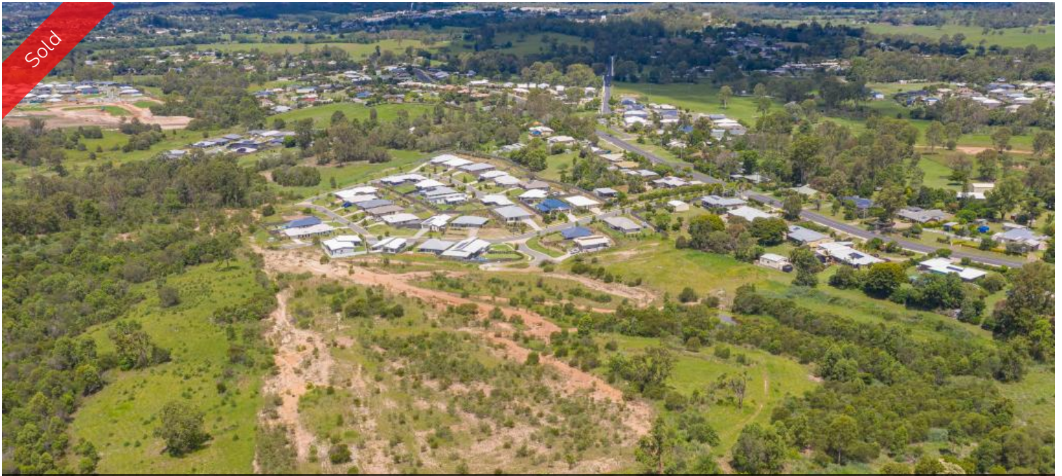
Lot 219 Laing Close, Southside