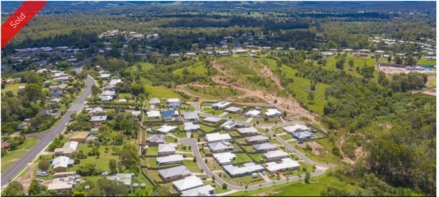
Lot 216 Laing Close, Southside