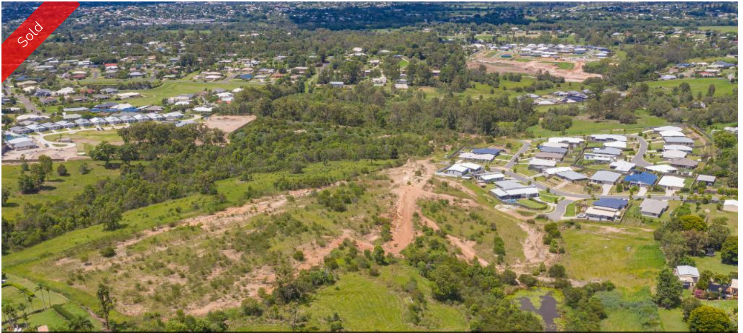
Lot 206 Brickfield Crescent, Southside