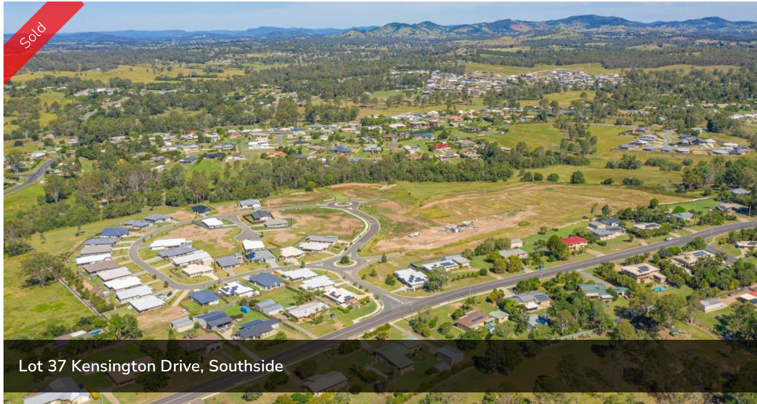
Lot 37 Kensington Drive, Southside