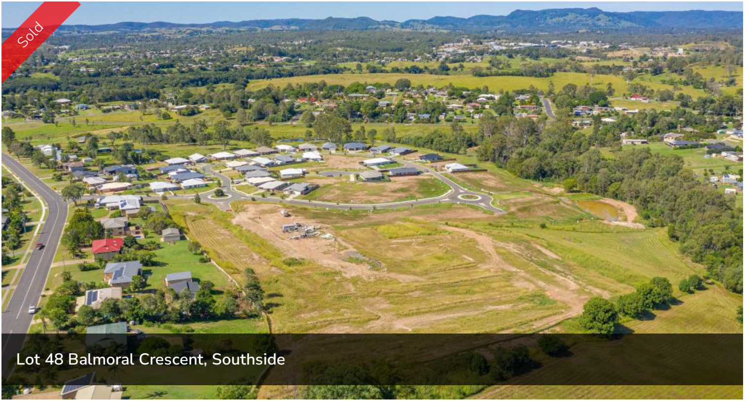
Lot 48 Balmoral Crescent, Southside