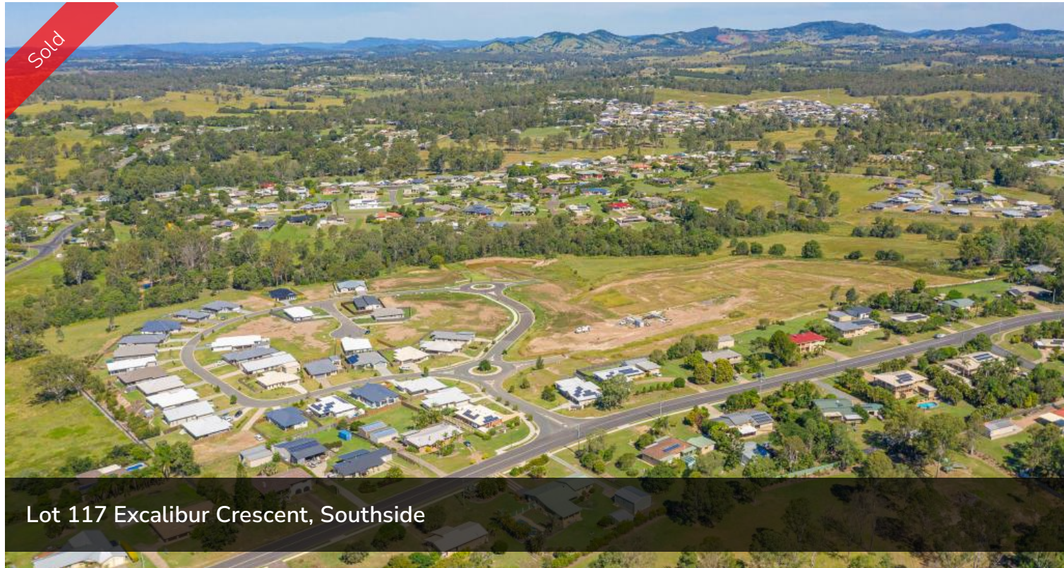
Lot 117 Excalibur Crescent, Southside