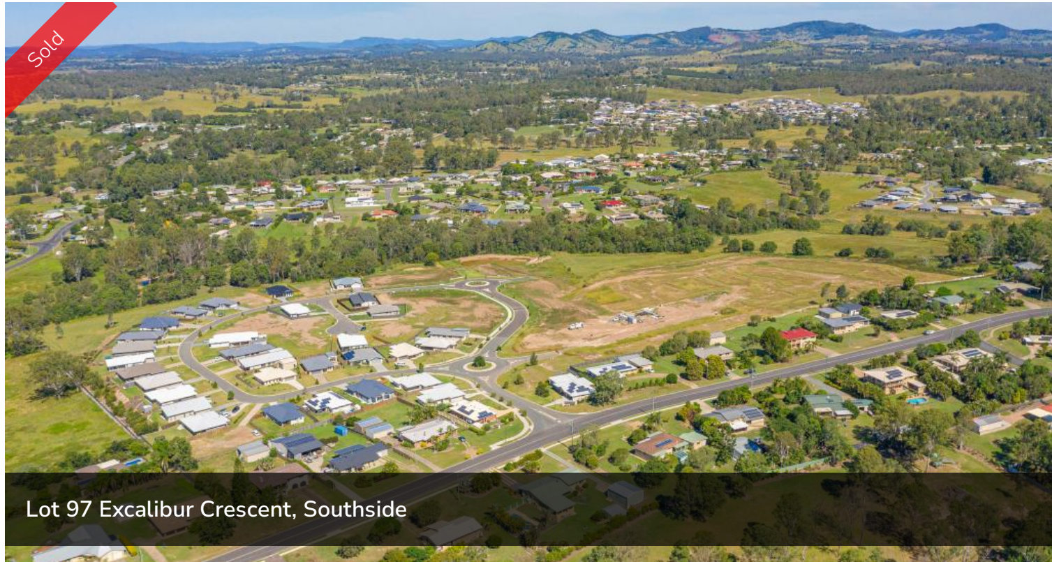
Lot 97 Excalibur Crescent, Southside