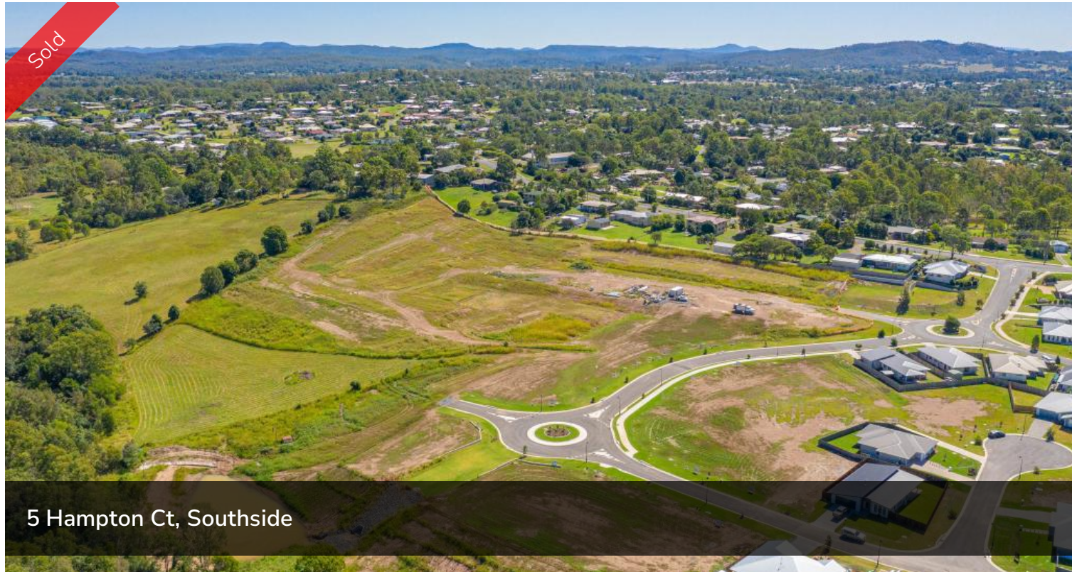
5 Hampton Ct, Southside