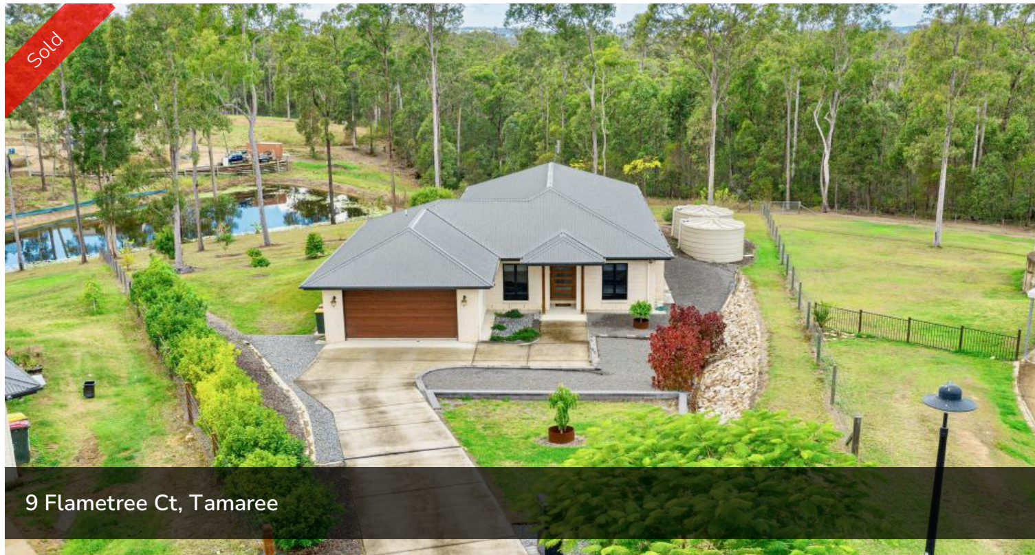
9 Flametree Ct, Tamaree